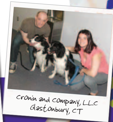
Cronin and Company, LLC Glastonbury, CT