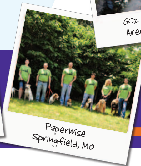
Paperwise Springfield, Mo

Download your free copy of the 2012 TYDTWDay Action Pack