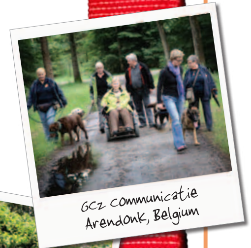
GCZ Communicatie Arendonk, Belgium