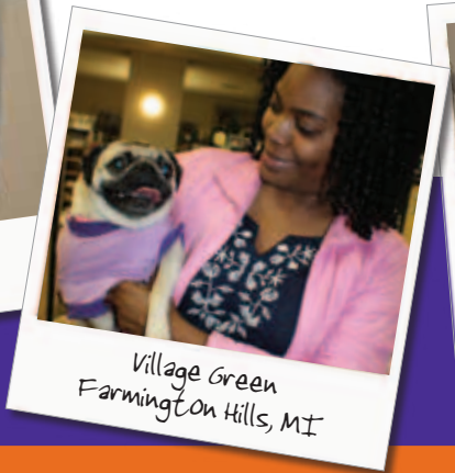
Village Green Farmington Hills, MI