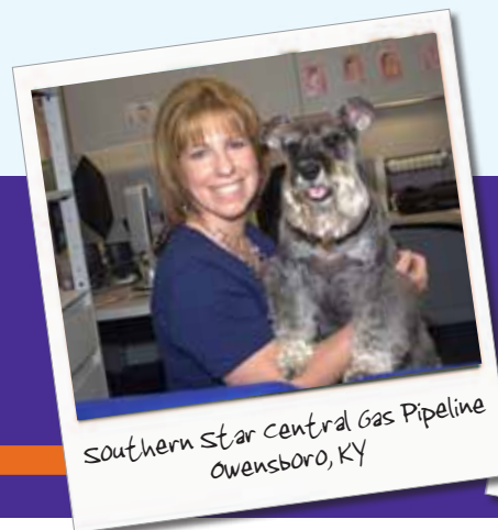
southern star central Gas Pipeline Owensboro, KY