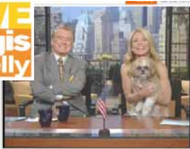
Friday, June 20th, 2008