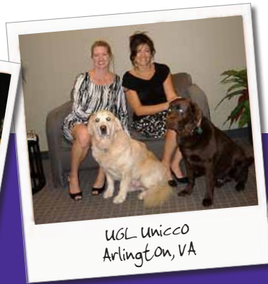
UGL Unicco Arlington, VA